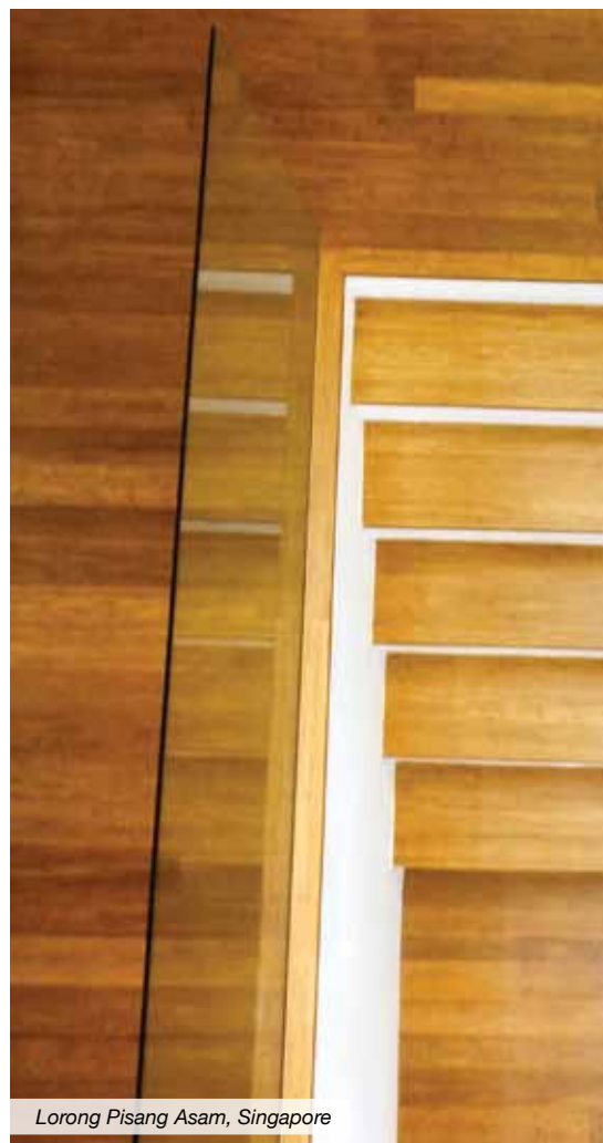
Lorong Pisang Asam, Singapore